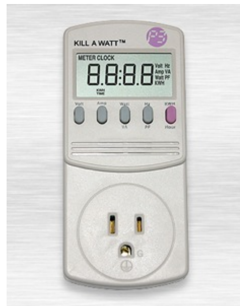
Large LCD display counts consumption by the kilowatt-hour

To check out the device, just call our Energy Efficiency Specialist, Susan Kroll, at 303-688-3100 ext. 206 to make an appointment to pick one up. There is no charge for this service; just return the meter in one week. The Operation Manual appears on the next page.